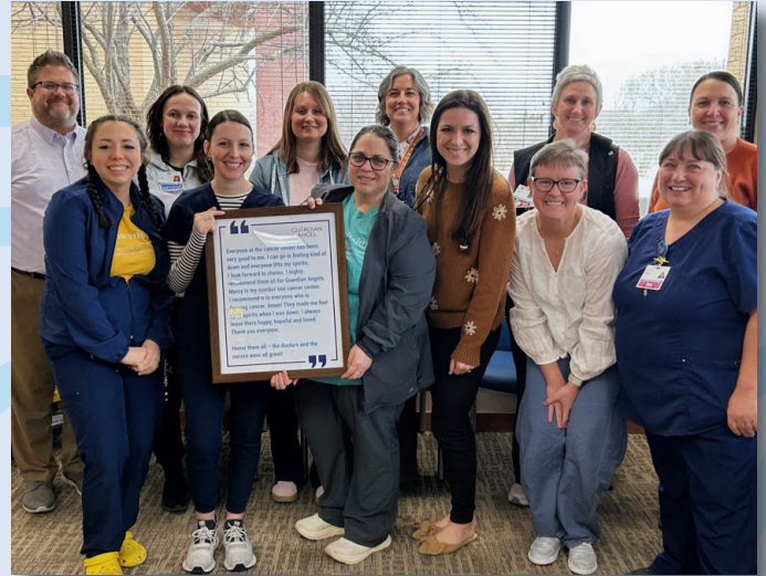
Cancer Care Team

Guardian Angel, a program of Ascension Wisconsin Foundation, invites patients to recognize any associate that made a lasting impact in their care. Please join us in celebrating recent Guardian Angels at Ascension Mercy!